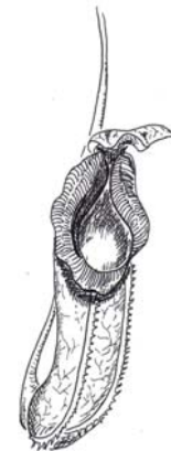
Nepenthes, "Pitcher Plant"