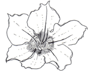
"Blue sky flower"

Enjoy your visit. Your donation is always welcome. Please visit again.