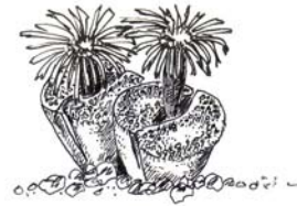
Lithops, "Living Stone"

Biology classes offered at Ball State require plant material for dissection and study. The Teaching and Research Greenhouse is used to grow the various plants needed by students to study in biology lab classes. In addition, space is provided for university sponsored research projects.