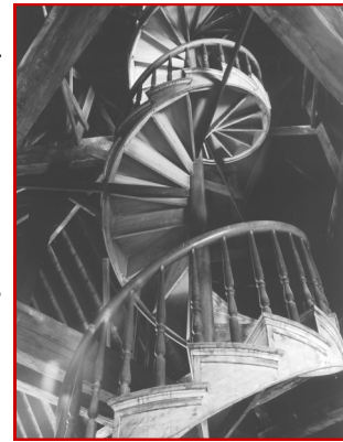
“Attic Stairs, Sullivan County”