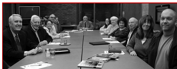
Board of Governors Meeting