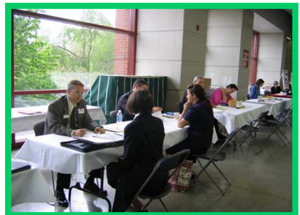
Teacher Fair Interviews