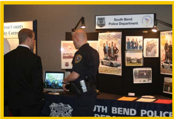
Criminal Justice Job Fair