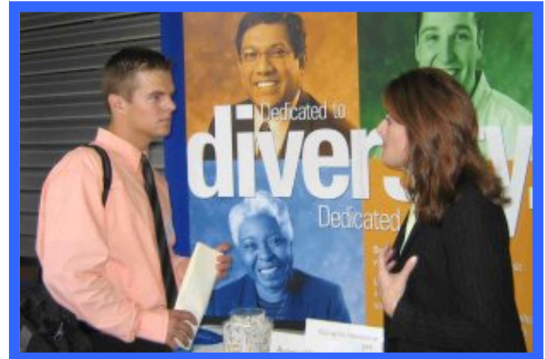
Cardinal Job Fair