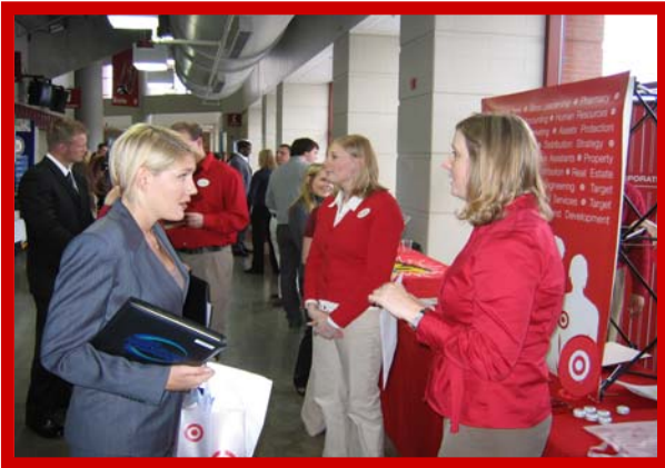
Cardinal Job Fair

Throughout the year, the Career Center assists various academic departments as they coordinate networking and job fairs for their students. Criminal justice, finance and insurance, marketing, nursing, and natural resources, among others, traditionally hold their own job fairs. Contact your academic department for more information.