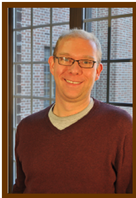
James Mitchell College of Architecture and Planning, the Miller College of Business, the Honors College, and the College of Applied Sciences and Technology