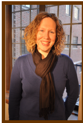
Willow King Locke College of Communication, Information, and Media, the College of Fine Arts, and undecided students