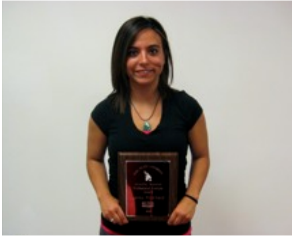
Laney Pritchard Professional Promise Award

Award given to the ATS who has shown the most progress towards professionalism during his/her time in the program including issues such as skills, academics, dedication, and professionalism.