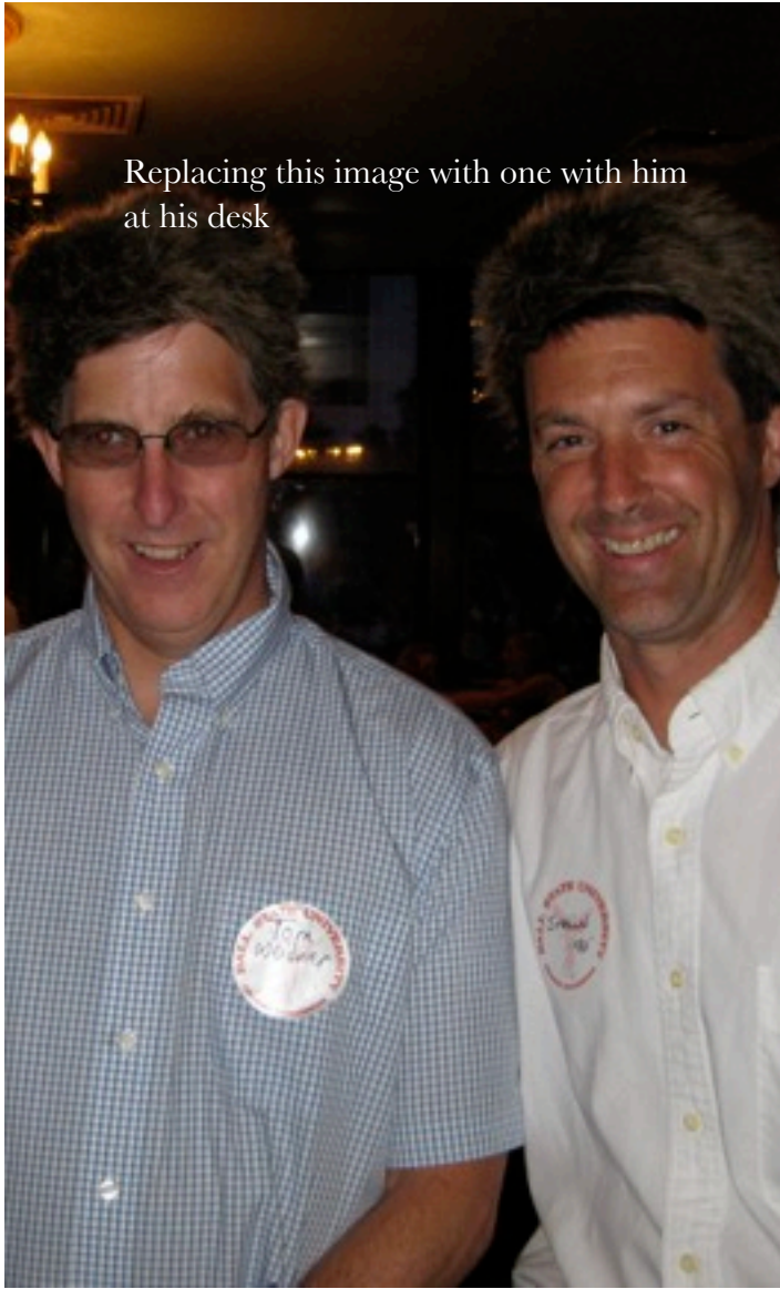
Replacing this image with one with him at his desk