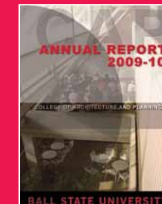
CAP Annual Report 09/10