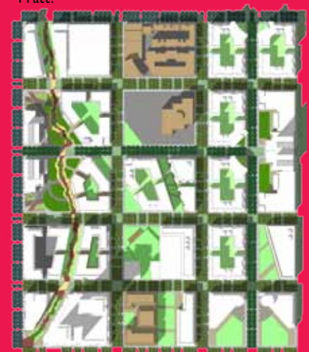
Urban Land Institute Hines Competition entry.