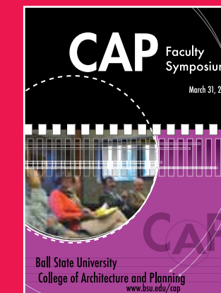
CAP Faculty Symposium '10