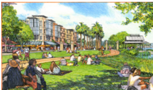
Waterfront Plan, Stockton, CA Bruce Race Studio