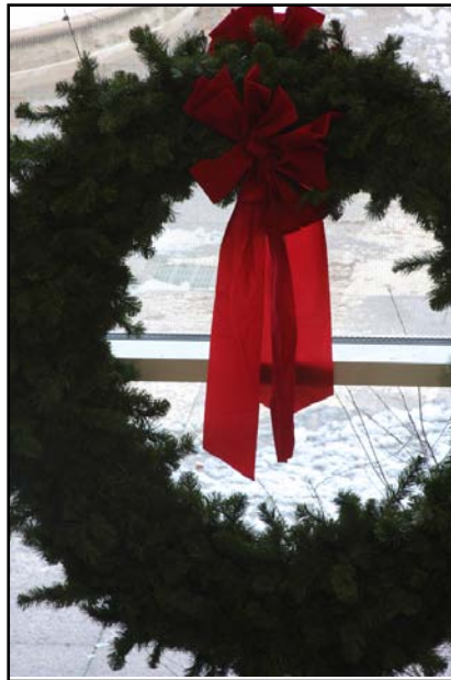
A holiday wreath in the Atrium.