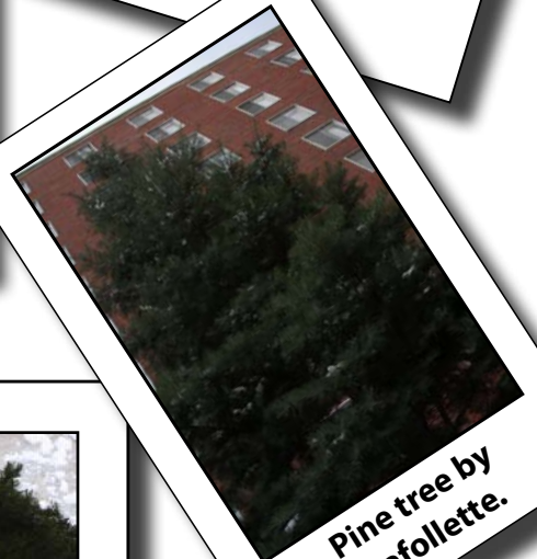
Pine tree by Lafollette.