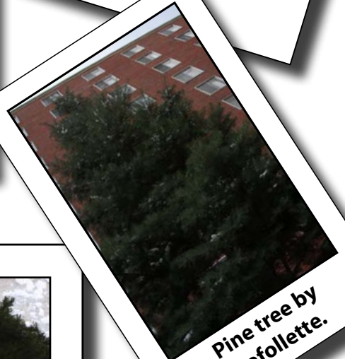
Pine tree by Lafollette.