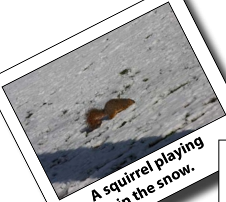
A squirrel playing in the snow.