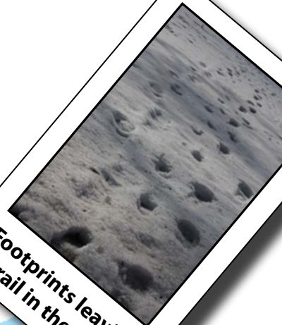
Footprints leaving a trail in the snow.