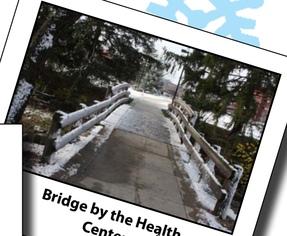
Bridge by the Health Center.