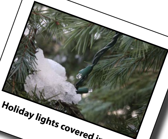
Holiday lights covered in snow.