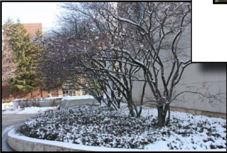
Snow on trees by Teacher's College.