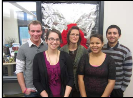
HAPPY HOLIDAYS! From the Comm Office Staff