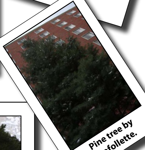
Pine tree by Lafollette.