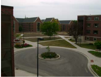
LEED Silver-rated Dehority Hall

Construction is also underway at the west end of the Carmichael Hall parking lot on the North District Energy Station, which is the hub of the operation that houses the heat pump chillers and water pumps. The station is scheduled for completion in February 2011 and Lowe says he expects water to be flowing by next summer. You can follow the station’s progress by viewing the Geothermal Drilling and