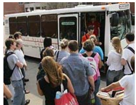
Ball State's hybrid shuttle bus makes a stop on McKinley Ave.

Last, but certainly not least, Ball State’s transportation fleet is green! The fleet boasts an all-electric postal vehicle, 11 biodiesel shuttle buses - six of them hybrids - and 20 buses running on biodiesel.