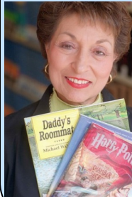
"an inspiring and spirited leader"