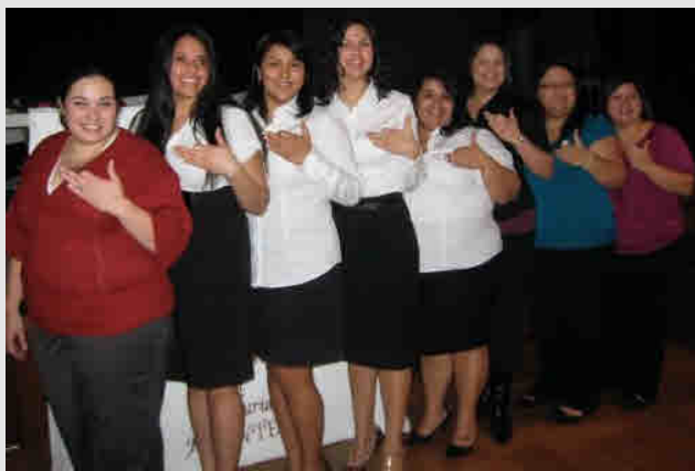
Women of Gamma Phi Omega Sorority, Inc. pose after a recent event.

The Delta Chapter of Gamma Phi Omega had many accomplishments in the past year. The chapter went from being a one women chapter, to at the end of the 2008-2009 school year, having seven very strong members. The women of the Delta Chapter were also recognized nationally with two of the members receiving national awards. At the awards banquet, held in mid-April, the chapter also received 'Notable Chapter of the Year'. On campus the ladies of Gamma Phi Omega have been recognized with the highest GPA in NPHC for the past two semesters. The chapter is looking forward to the future and has set many high goals that it looks forward to meeting this next year.