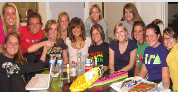
New members of \text{AG}\Delta have fun at their fall new member sleepover

The women of Alpha Gamma Delta have had a very successful spring semester. We welcomed 6 new members who were initiated on April 3 and already some of them have stepped up and taken leadership positions. We have been fortunate enough to hold a different sisterhood event every month, with themes including a Progressive Dinner and a Valentine-making party. We had our spring formal at The Regency in Muncie on March 21 and we also held our annual International Reunion Day with alumnae on April 19, which included a Zumba lesson for participants. Alpha Gam's annual philanthropy, our Par-Tee Golf Tournament, was held at The Player's Club in Yorktown on April 25. We are looking forward to another great semester in the fall!