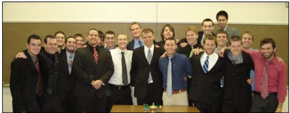
The men of the Lambda Chi Alpha colony pose after a meeting