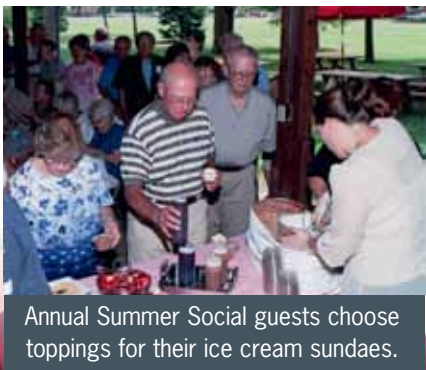
Annual Summer Social guests choose toppings for their ice cream sundaes.