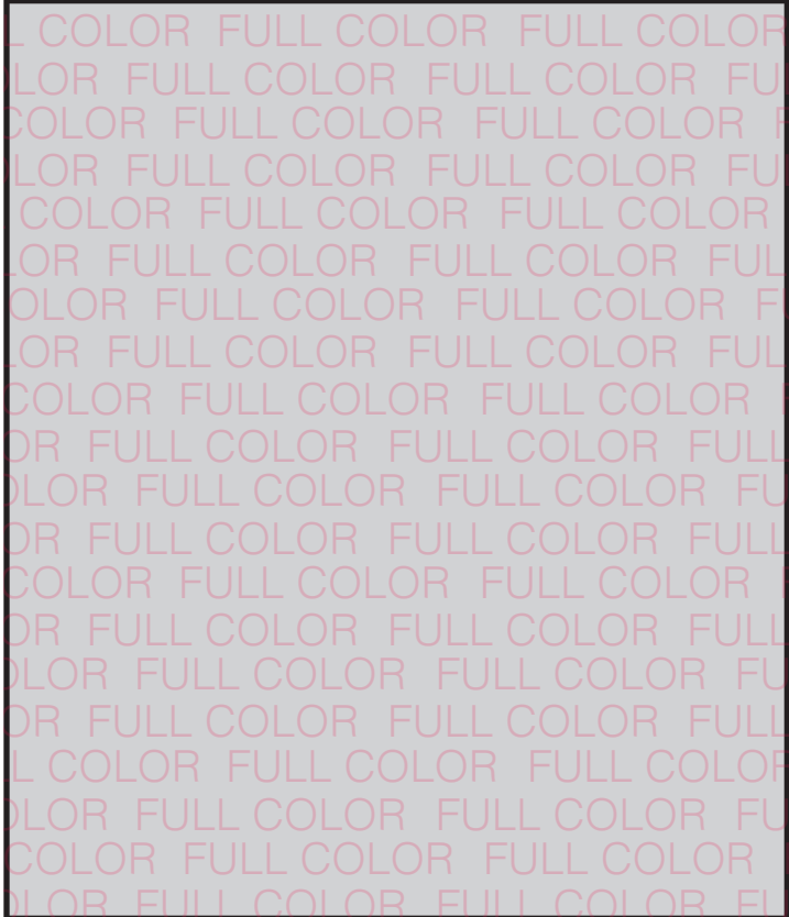
DIGITAL SIGNAGE - 268x315px

SUBMISSION STANDARD: ACTUAL SIZE .PNG format only